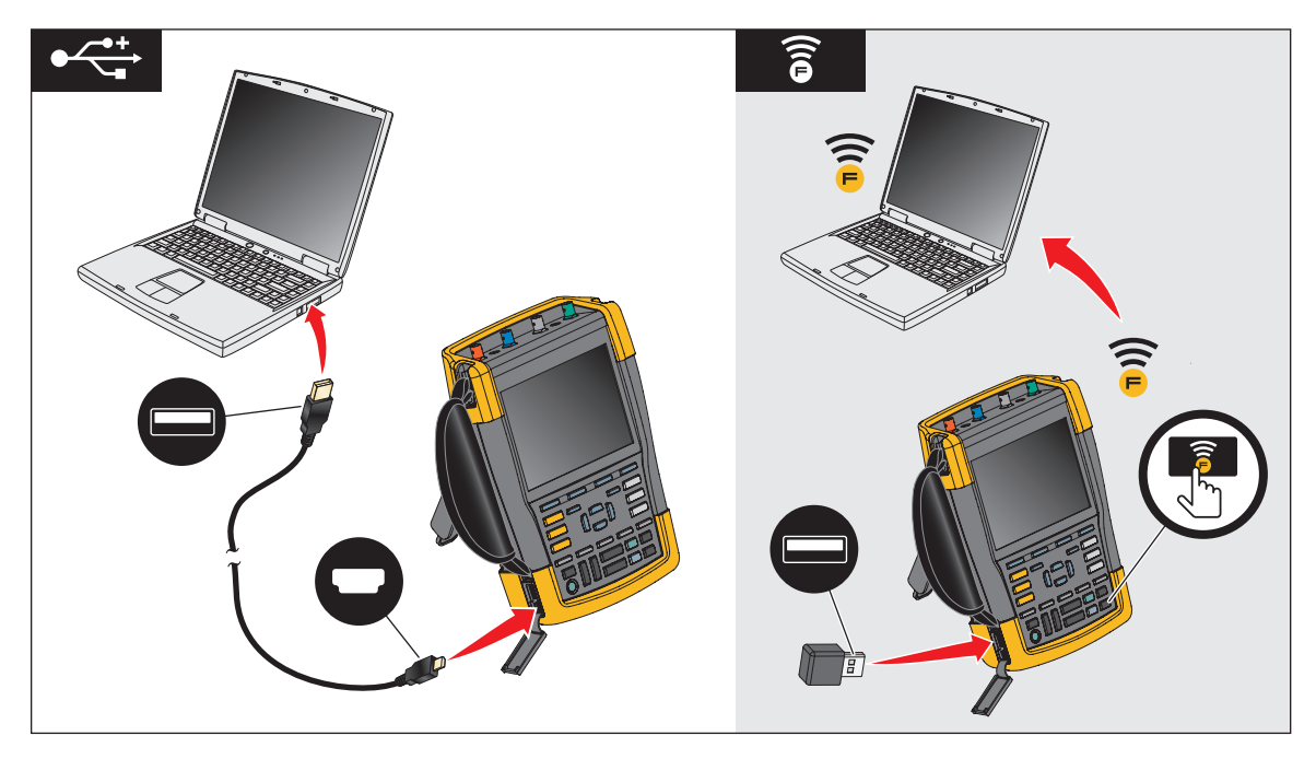
Figure 1. Test Tool to PC Connections